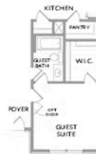
OPT Guest Suite w. Full Bath ilo Living RM, Powder RM & Home Office