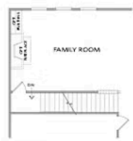
Layout When on a Basement