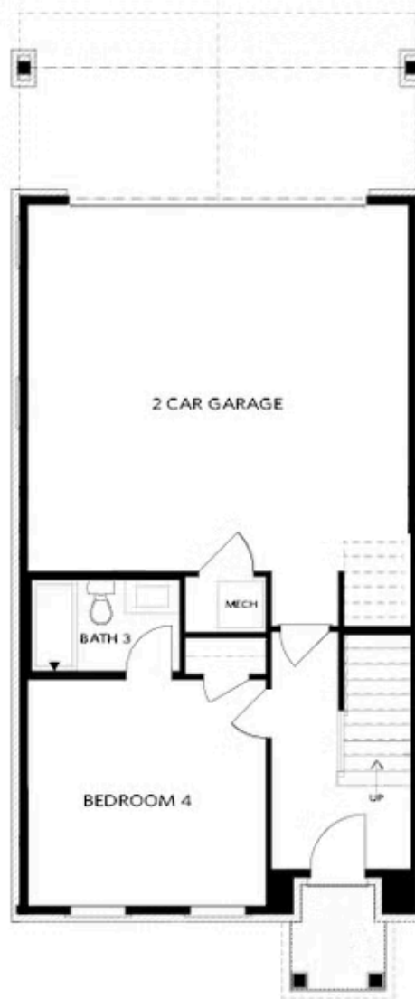
Elevations E & F