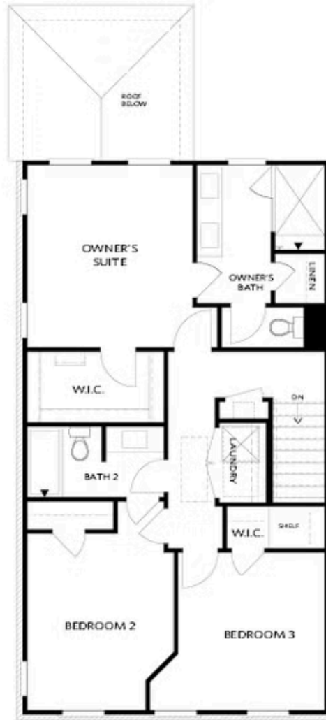
Elevations E & F