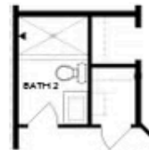
OPT Shower Only