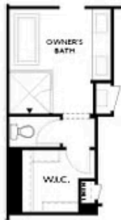
OPT Owner's Shower & Free Standing Tub Combo