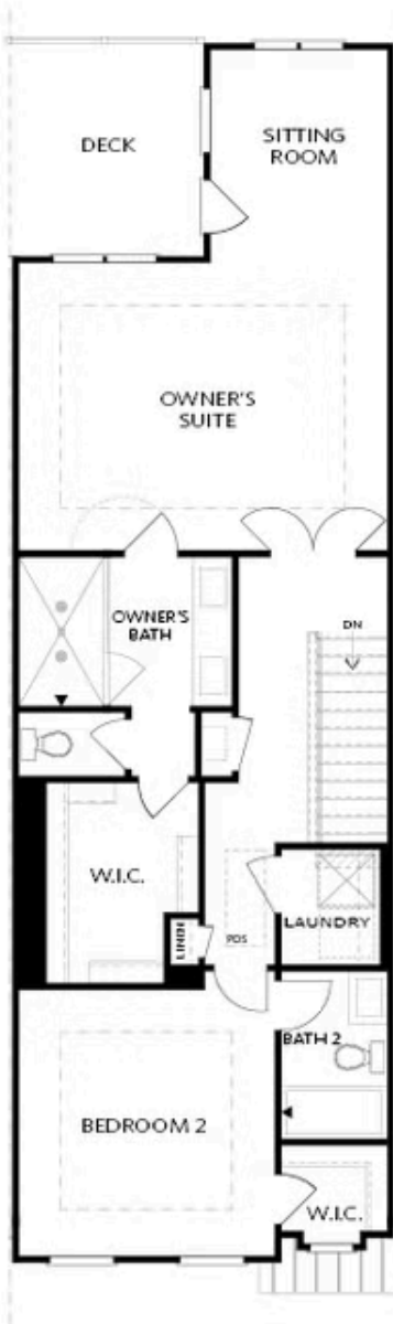
Elevation M Floor Plan Layout