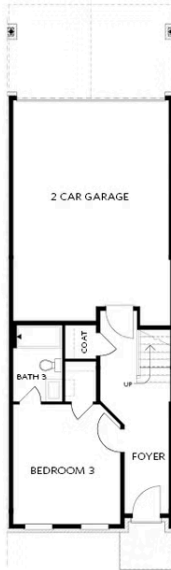
Elevation M Floor Plan Layout