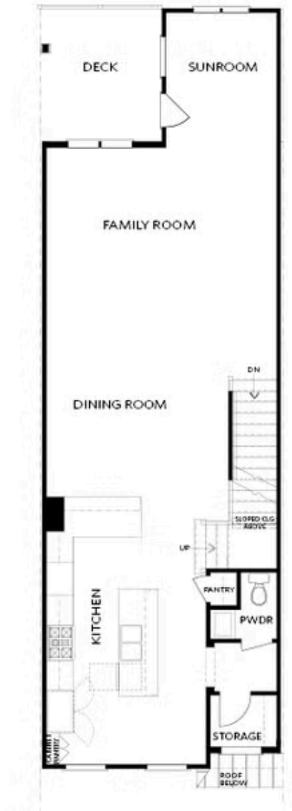
Elevation M Floor Plan Layout