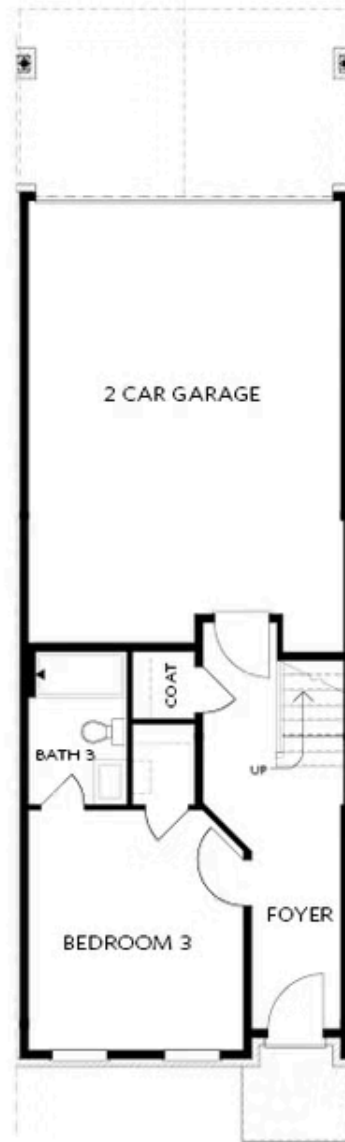
Elevation M Floor Plan Layout