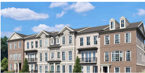
Grayson III - Benton III - Taylor I - Townhome Building