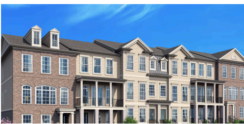
Grayson III - Benton III - Taylor I - Townhome Building