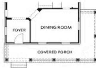
OPT Side Porch - Kitchen Middle *Per Lot Fit