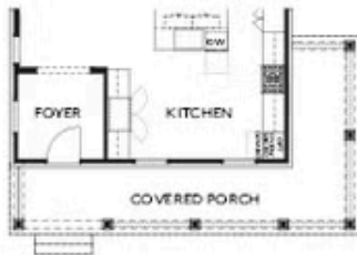
OPT Side Porch - Kitchen Front *Per Lot Fit