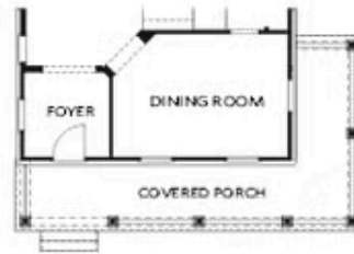
OPT Side Porch - Kitchen Middle *Per Lot Fit