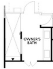
OPT Large Shower