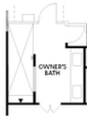
OPT Large Shower