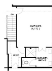
OPT 2nd Owner's Suite into BDR 3