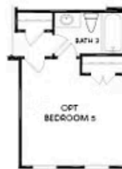
OPT Bedroom 5 w/ Bath 3 into Dining Room & Powder Room