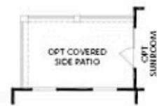
OPT Covered Side Patio *Only Available When OPT Sunroom Selected