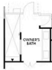
OPT Large Shower