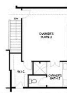
OPT 2nd Owner's Suite into BDR 3