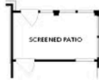
OPT Screened Patio