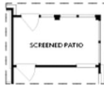
OPT Screened Patio