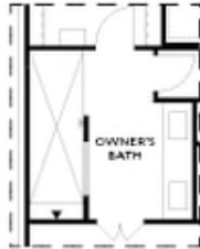
OPT Large Shower