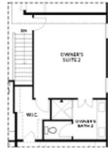
OPT 2nd Owner's Suite ilo BDR 3