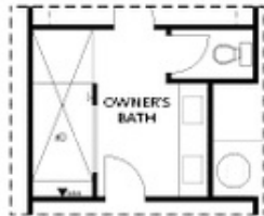
OPT Walk-In Shower