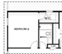
OPT BDR 4 ilo Loft