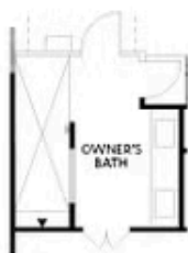
OPT Large Shower