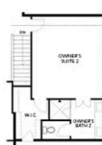
OPT 2nd Owner's Suite w/ BDR 3