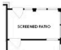
OPT Screened Patio