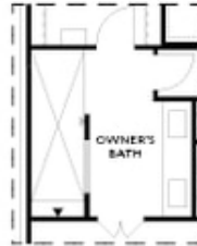
OPT Large Shower