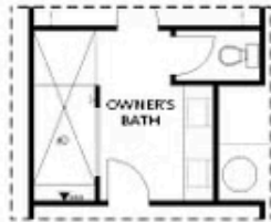
OPT Walk-In Shower