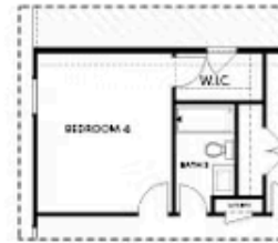
OPT BDR 4 ilo Loft