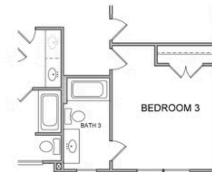
OPT BATH 3 * Elevation B ONLY