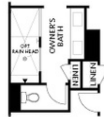
OPT Owner's Walk-Through Shower