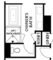
OPT Owner's Shower & Tub Combo