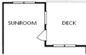
OPT Sunroom ilo Full Deck