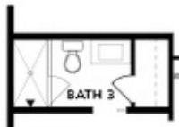
OPT Shower ilo Tub/Shower Combo