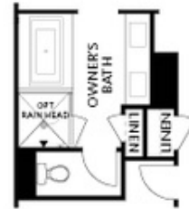
OPT Owner's Shower & Tub Combo