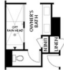
OPT Owner's Walk-Through Shower