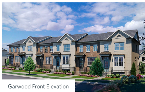
Garwood Front Elevation