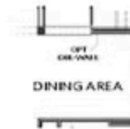
OPT Division Wall for Dining