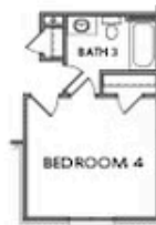
OPT Bedroom 4 & Bath 3 into Study & Powder Room