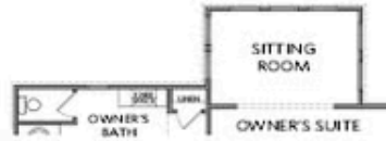
OPT Owner's Sitting Room