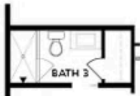
OPT Shower ilo Tub/Shower Combo