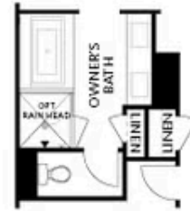
OPT Owner's Shower & Tub Combo