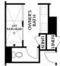
OPT Owner's Walk-Through Shower