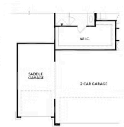
OPT Saddle Garage *Per Lot Fit