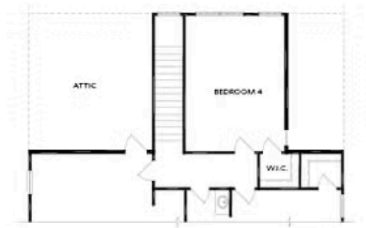
OPT Bedroom 4 flo Loft