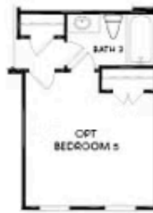
OPT Bedroom 5 w/ Bath 3 also Dining Room & Powder Room