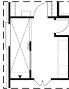
Optional Owner's Walk-In Shower