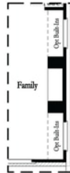
Optional Linear Fireplace