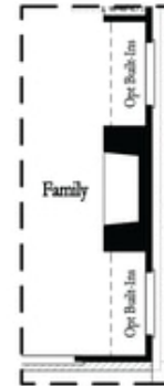
Included Fireplace 36" Direct Vent