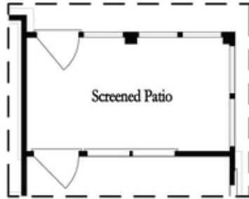
Optional Screened Patio