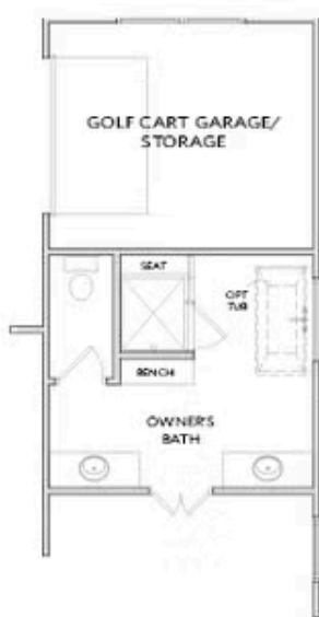
OPT Golf Cart Garage