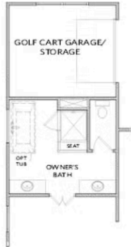
OPT Golf Cart Garage *Note - Layout of Bathroom Changes