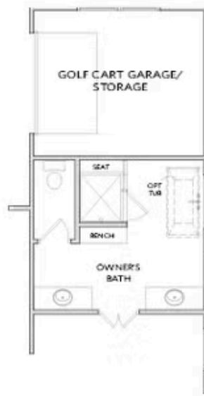
OPT Golf Cart Garage