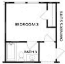
OPT Bedroom 3 & Bath 3 ilo Study