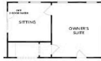
OPT Sitting Room ilo Study