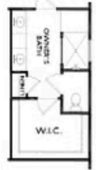
OPT Walk-In Shower