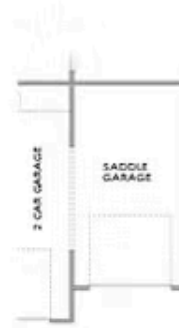
OPT Saddle Garage *Per Lot Fit