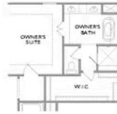
OPT Free Standing Tub in Owner's Bath