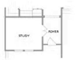
OPT Study into Dining Room