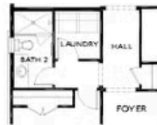
OPT Shower Only at Bath 2 with 2 Bedroom Layout