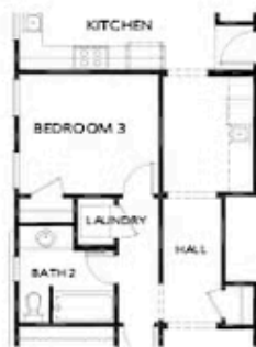
OPT Bedroom 3 ilo Covered Patio