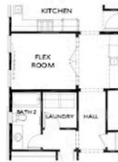
OPT Flex Room ilo Covered Patio