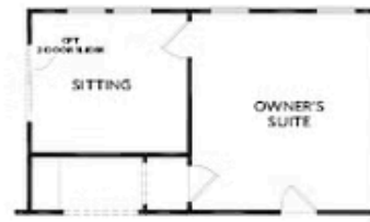
OPT Sitting Room ilo Study