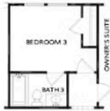
OPT Bedroom 3 & Bath 3 ilo Study