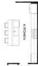
OPT Gourmet Kitchen