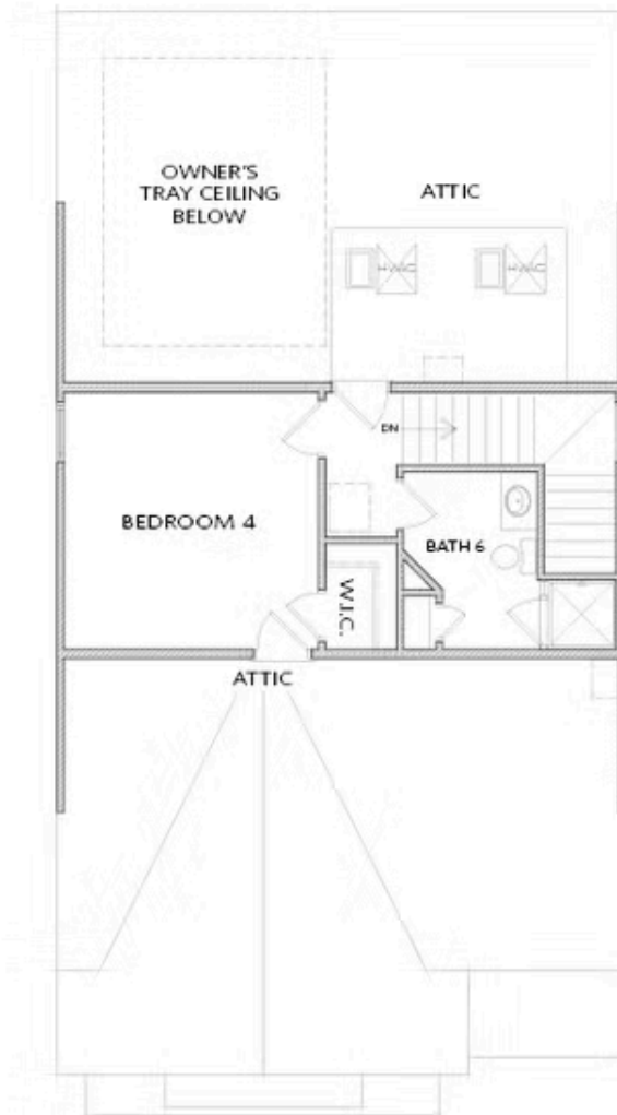
Elevation C & D