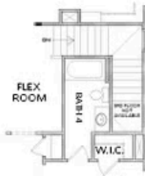
OPT Second Floor 3rd Bath When NO Third Floor is Selected