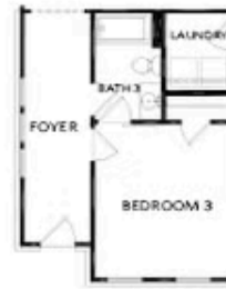
OPT Bedroom 3 & Bath 3 No Study & Powder Room