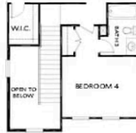
OPT Bedroom 4 & Bath 3 ilo Loft