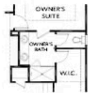
OPT Zero-Threshold Shower