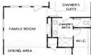
OPT Linear Fireplace