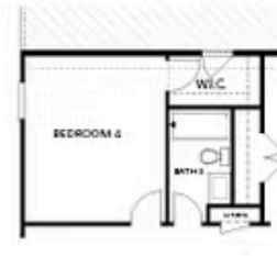
OPT BDR 4 ilo Loft