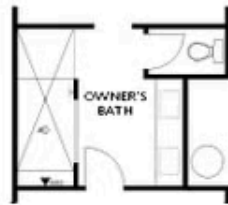
OPT Walk-In Shower