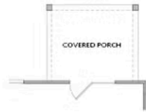
OPT Covered Porch