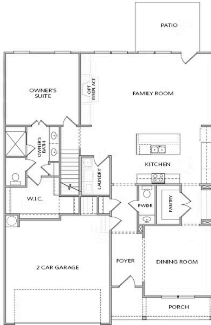
Elevation A, B, C