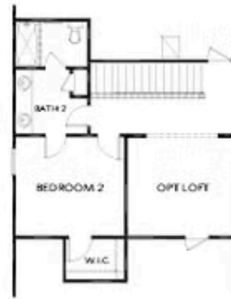
OPT Loft ilo Bedroom 3