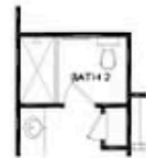
OPT Shower Only