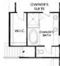
OPT Tub & Shower