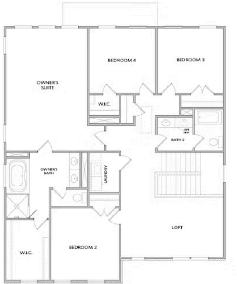
Elevation A, B, C, D