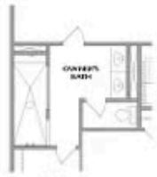
OPT Owner's Walk-in Shower