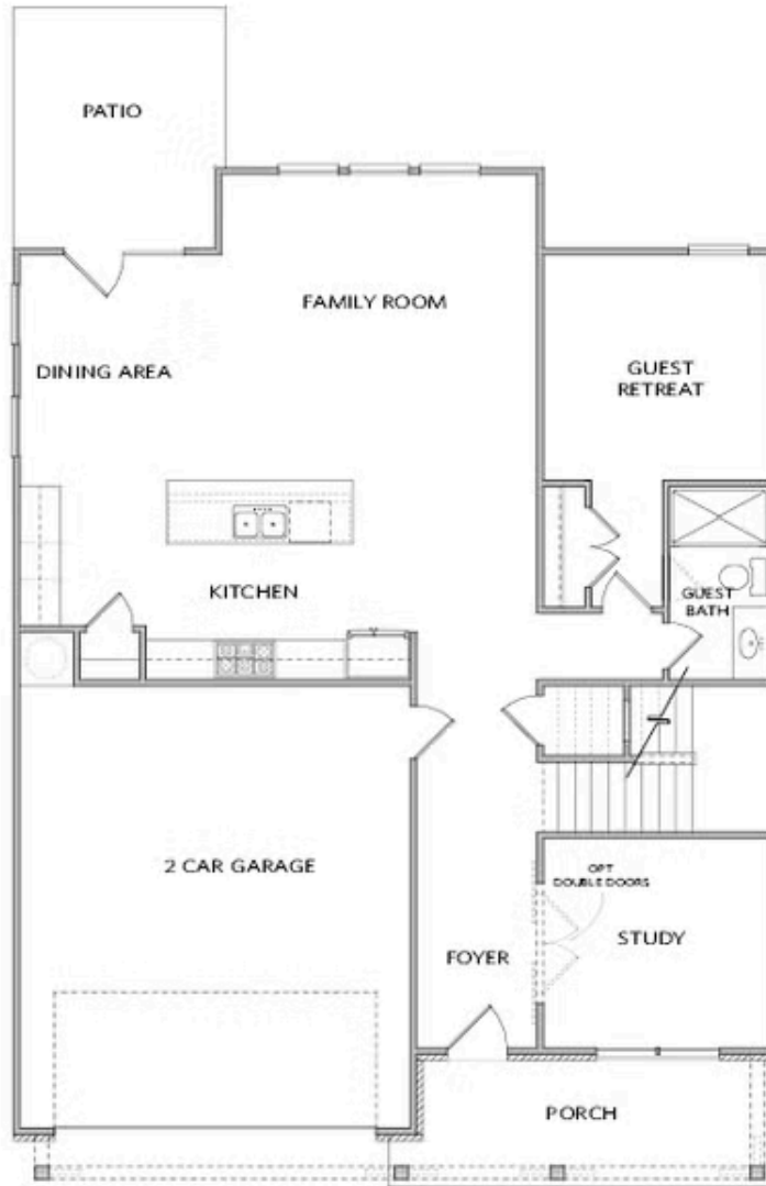
Elevation A, B, C, D