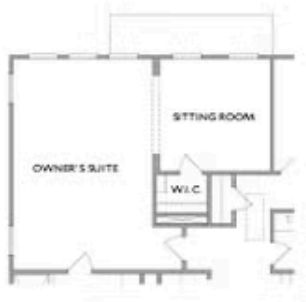
OPT Sitting Room ilo Bedroom 4