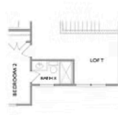
OPT Bath 3