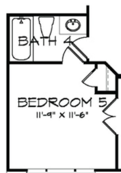
5th Bedroom ILO of Study