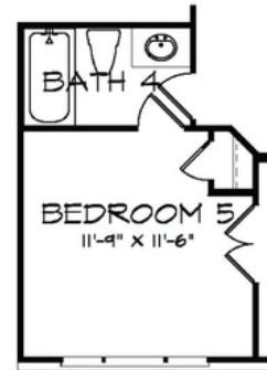
5th Bedroom ILO of Study