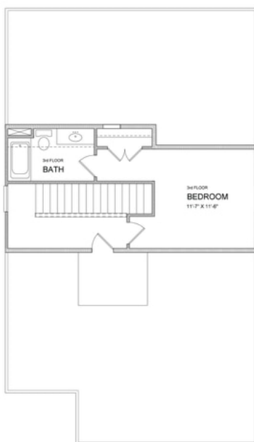
Optional Third Floor