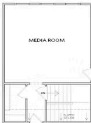
OPT Media Room