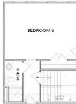
OPT Bedroom 6 w. Full Bath 6