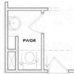
OPT 3rd Floor Powder Room