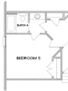
OPT Bedroom 5 with Full Bath 4 ilo Study and Powder Room