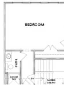
OPT 3rd Floor with Bedroom & Full Bath