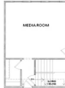
OPT 3rd Floor Media Room