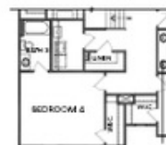
OPT Bedroom 4 with Bath 3 ilo Bonus Room & Powder 2