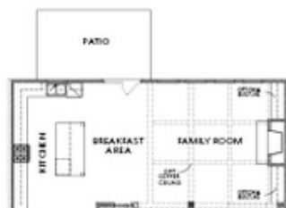
OPT Extended Kitchen