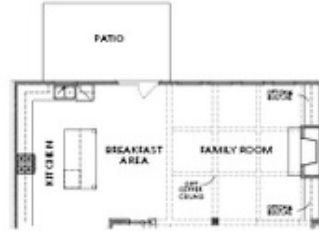
OPT Extended Kitchen