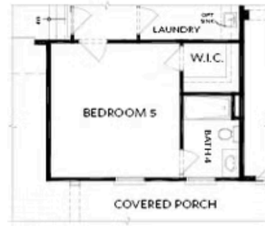
OPT Bedroom 5 ilo 1-Car Garage