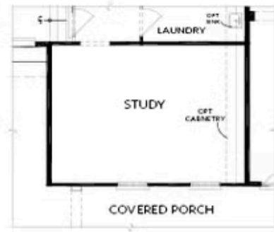
OPT Study ilo 1-Car Garage