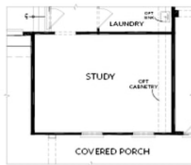
OPT Study ilo 1-Car Garage