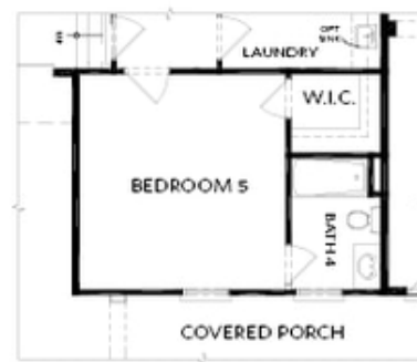
OPT Bedroom 5 ilo 1-Car Garage