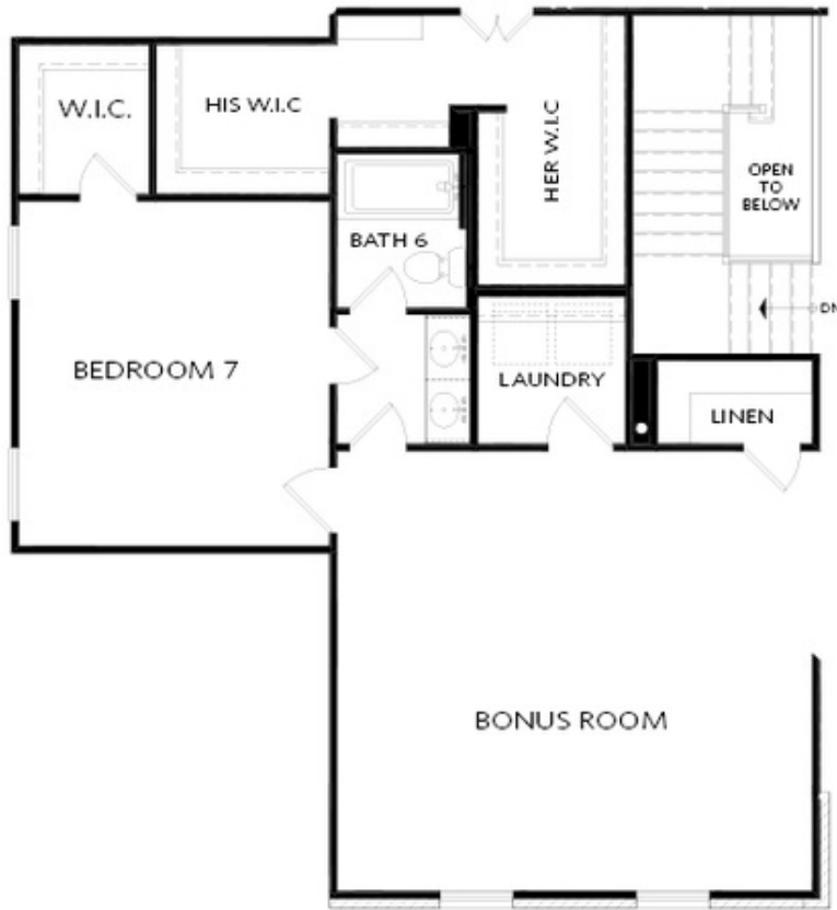
OPT Bedroom 7 and Full Bath 6 with Bonus Room Layout