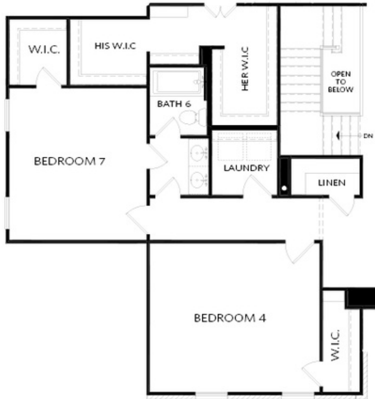
OPT Bedroom 7 and Full Bath 6 with Bedroom 4 Layout