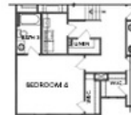
OPT Bedroom 4 with Bath 3 ilo Bonus Room & Powder 2