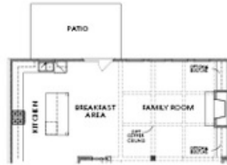
OPT Extended Kitchen