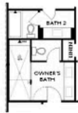
OPT Walk-Through Shower