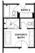
OPT Freestanding Tub with Seperate Shower