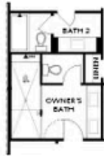
OPT Walk-Through Shower